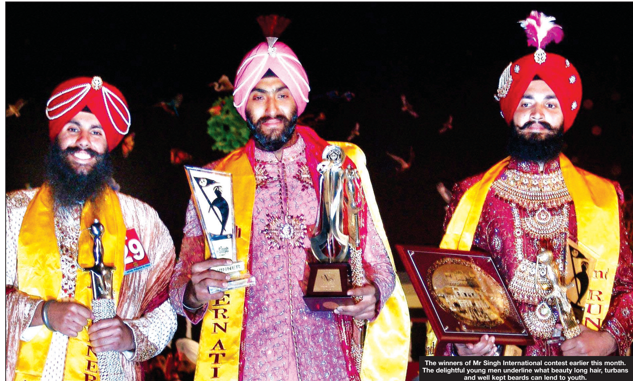
The winners of Mr Singh International contest earlier this month. The delightful young men underline what beauty long hair, turbans and well kept beards can lend to youth.

The theory of evolution infers that every species adapts in its anatomy, changes advantageously to itself in its struggle for survival against the set of challenges it has to confront. It retains the characters which give it an edge and discards those which are either of no use or a liability. The fact that human hairs have been retained and evolved through the grim battle of human survival for millions of years is a definite pointer to their being of a genetic asset the significance of which is not yet perceived by us.